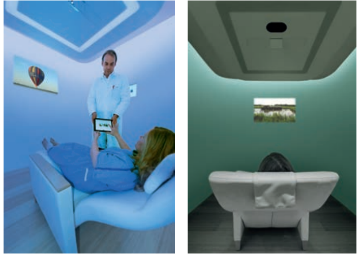
Results: a feeling of calm and sense of control

As part of the research at NKI-AVL hospital, fifty patients completed a self-assessment questionnaire following the procedure. The results demonstrate a significant reduction in patient anxiety when Ambient Experience is in place in the uptake room.