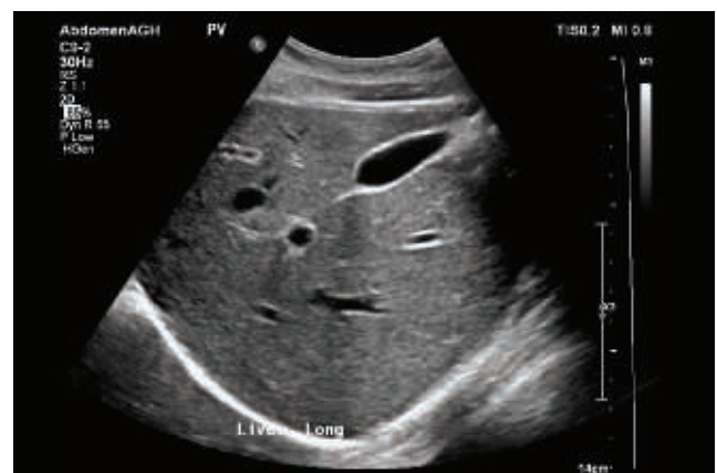
Liver parenchyma with C9-2 PureWave transducer