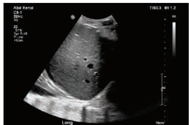
Trace of perihepatic ascites