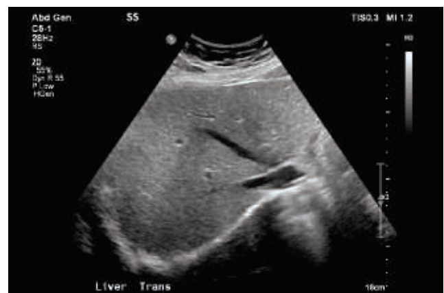
Liver parenchyma with C5-1 PureWave transducer

Metavir score F0. No evidence of acute disease.