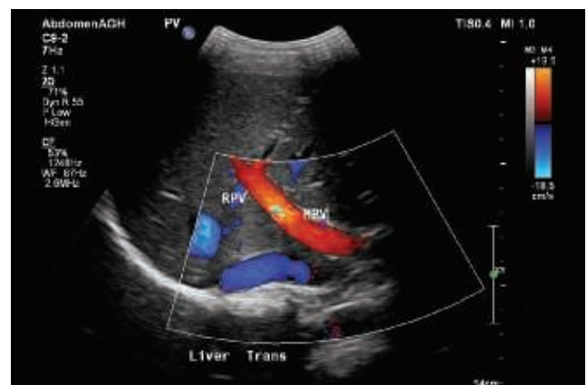
Portal vein assessment during bedside exam with C9-2