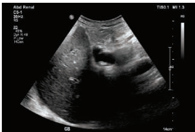
Gallbladder packed with stones, posterior shadowing

Metavir score F3/F4 consistent with moderate to severe fibrosis. Heterogeneous hepatic steatosis with borderline splenomegaly. Elastography corresponding to F3/F4 consistent with moderate to severe fibrosis.