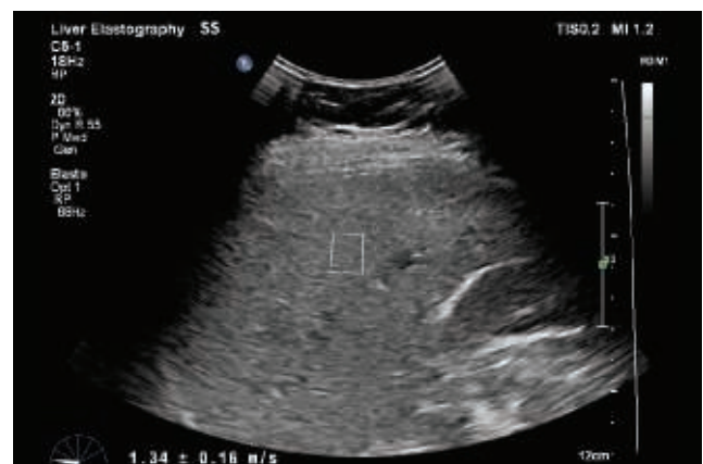
Liver stiffness measurement with ElastPQ