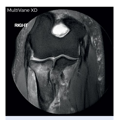
Imaging with MultiVane XD provides excellent image quality, even in presence of motion.

not correct the same. By choosing the MultiVane percentage as NSA (e.g. 4 NSA would be the same as 400%) for keeping SNR equivalent, all data will be corrected to the same image correction. For data at minimum 200%, which started at 1 NSA, dS SENSE can be used for reducing the scan time back where it started."